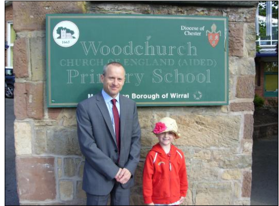
Rainbows across Wirral celebrated by wearing their uniform to school on 30th May